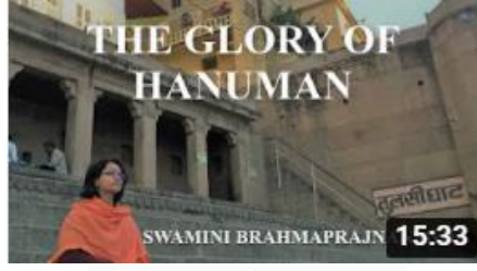
The glory of Hanuman

Subscribe | aarshavidyabharati@gmail.com | Aarsha Vidya Foundation | Arsha Vidya Ananda | SHINE